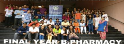
FINAL YEAR B. PHARMACY